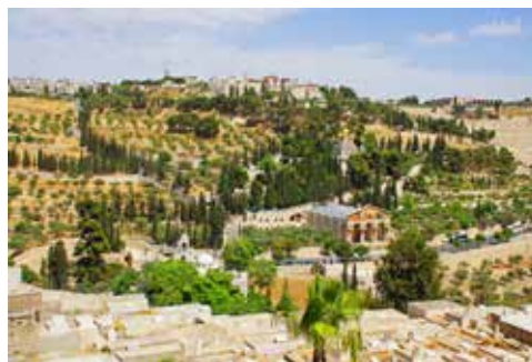
The Mount of Olives where Jesus ascended over 2,000 years promising His disciples that He would return. Jesus said, "I will come again and receive you to Myself; that where I am, there you may be also" John 14:3 (NKJV). He said, "Then the sign of the Son of Man will appear in heaven, and then all

come again and receive you to Myself; that where I am, there you may be also" John 14:3 (NKJV). He said, "But as the days of Noah were, so also will the coming of the Son of Man be. For as in the days before the flood, they were eating and drinking, marrying and giving in marriage, until the day that Noah entered the ark, and did not know until the flood came and took them all away, so also will the coming of the Son of Man be." Matthew 24:36-39 (NKJV)