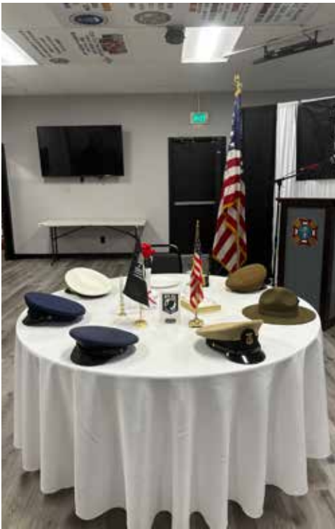
Missing Man Table