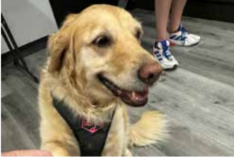
We had a guest for our Shelter to Soldier fundraising trivia night - Nala!