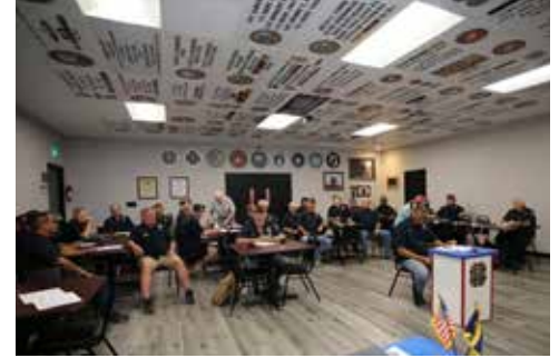
Be sure to join us for our next Post happy hour & general meeting on October 17 th at 6PM.