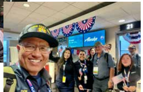
Chaps & the airline crew.