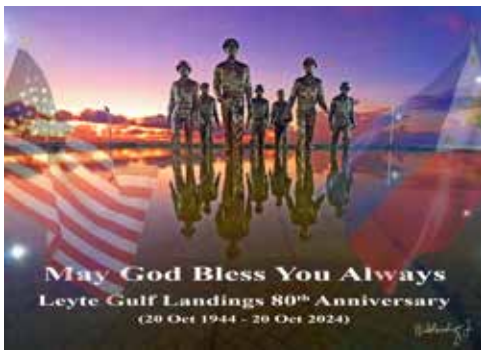
The Return - General Douglas MacArthur gave credit to the grace of the Almighty God after returning to the Philippines on Friday 20 October 1944 in Palo, Leyte. General MacArthur, hailed by Filipinos as a great hero, returned to the Philippines because of his love for the people. He helped in liberating

Spiritually speaking, Jesus ascended to heaven 2,000 years ago from the Mount Olives, Israel and His disciples were, and present-day followers are still waiting for His return. (I am honored to have the rare opportunity to visit the sacred ground of Mount Olives, Israel on May 28, 2011, and February 17-19, 21, 2024.) I still believe that Jesus is coming back soon. God operates in kairos, means the right, critical, or opportune moment while man operates in chronos (chronological or sequential time).