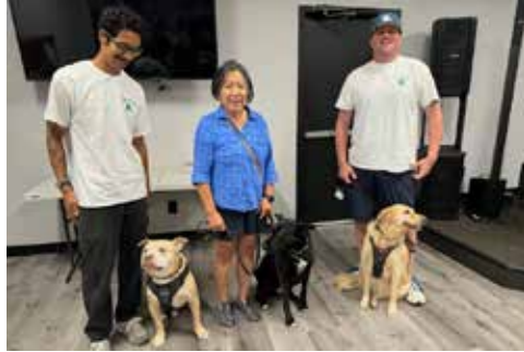
Special thank you to the representatives from Shelter to Soldier for stopping by trivia night!