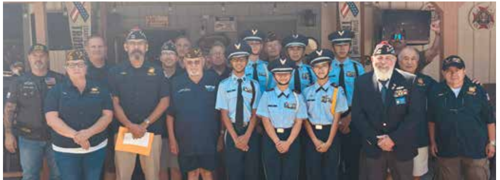
Post Officers with the Scripps Ranch HS JROTC.