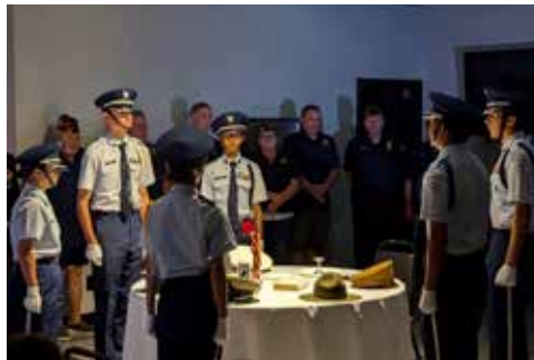
Scripps Ranch HS JROTC doing a salute at the POW/MIA ceremony