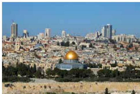
The Old City of Jerusalem, home of the three monotheistic religions (Jewish, Christianity, and Islam). The photo was taken on February 18, 2023, from the east side of Mount of Olives where Jesus ascended over 2,000 years promising His disciples that He would return. Jesus said, "I will

MacArthur said, "I shall return." Jesus said, "I will come again." "I shall return" means that there is a possibility that I may come back. It also implied that I may not make it back. In other words, it was not a hundred percent sure General MacArthur would be able to keep his promise to return. On the other hand, when Jesus said, "I will come back," it means with complete certainty, without a shadow of a doubt that He will return to earth someday.