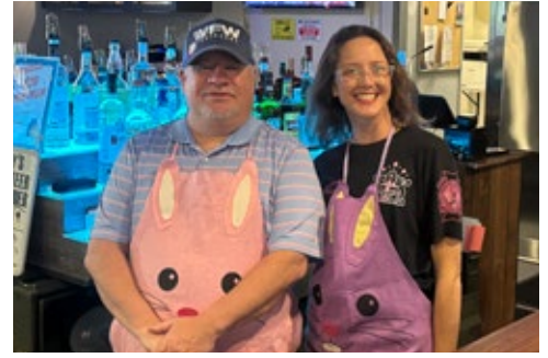
Easter Fun. Lots of good food and a visit from the Easter Bunny.