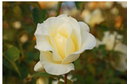
Flowers for all mothers on your Special Day!