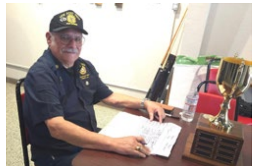
7907 showed up in force and won the 1 st Annual Commanders Cup trophy!