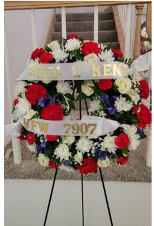
Beautiful wreath for LT Fred L. Kent gravesite.