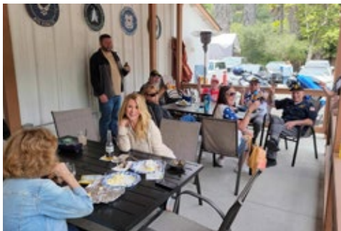
There was a large turnout at the Post after the ceremony at Dearborn Memorial Park.