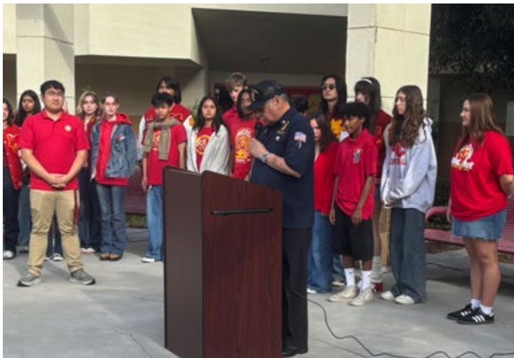
Butch addressing the students.