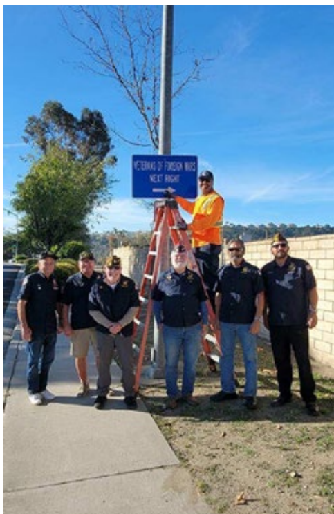
City of Poway installing Post sign.