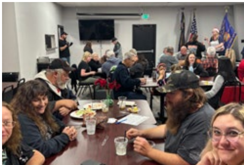
We had a great turn out for dinner & trivia.