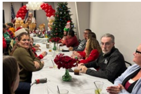
We had a great turn out for our annual Christmas party and potluck. A good time was had by all.