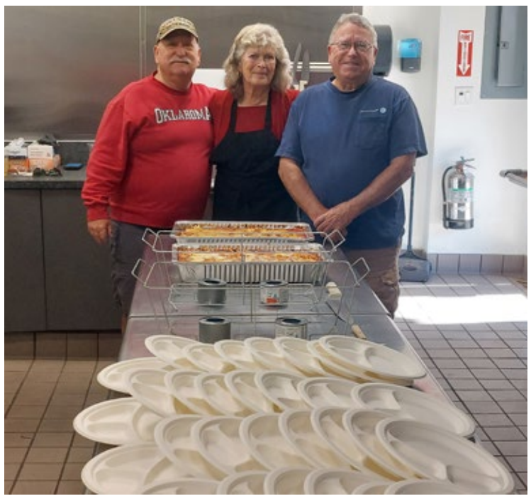
Wednesday Lunch Crew preparing for the last lunch of 2024.

Apr 20 – Easter Brunch *This year we will have an Easter egg hunt as well*