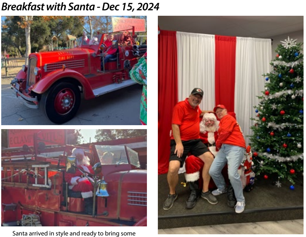
Santa spent the morning taking gift requests at our District Auxiliary fundraiser on 12/15.