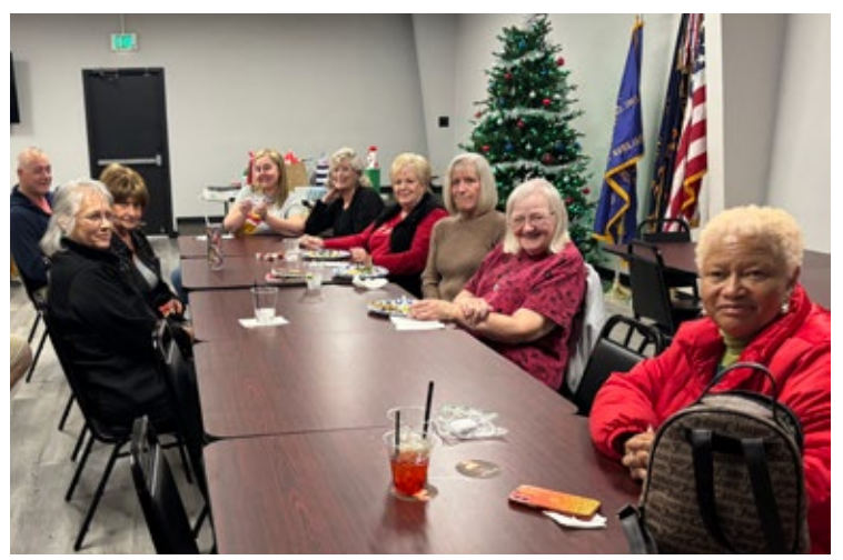
Auxiliary pre-meeting fun.