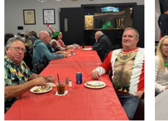
We had a good turn out for the Christmas party. Thank you to everyone who has made the Post as success.