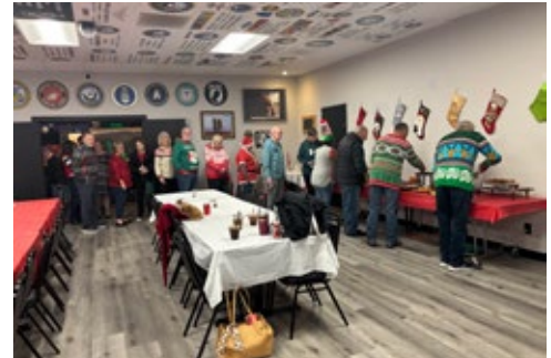
We had a nice spread. Thanks to all who brought a dish.