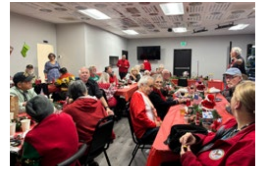
Thank you to all our Vietnam Veterans. It was a pleasure to host a Christmas party for you.