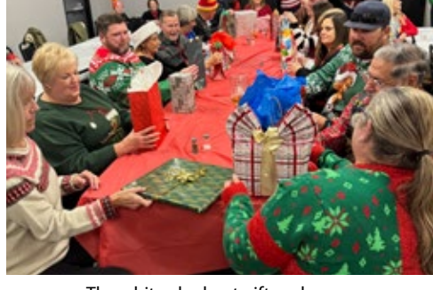
The white elephant gift exchange.