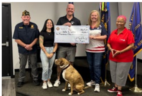
Shelters the Soldier $10,000 donation presentation on Nov.4 th .