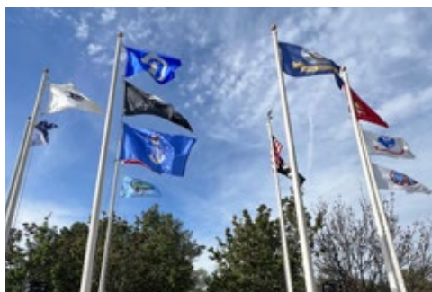
Flags at the Veterans Park in Poway.