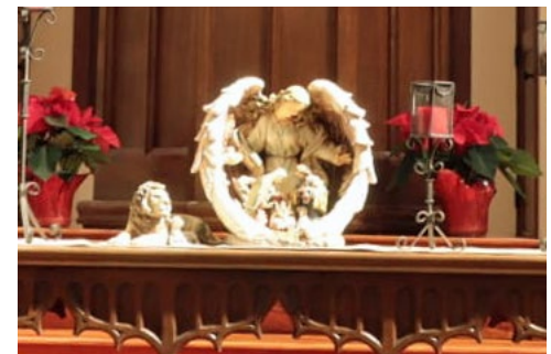
The manger is the central display on Dec 3, 2019, at Chatlos Chapel, Billy Graham Training Center at the Cove, Asheville, NC.