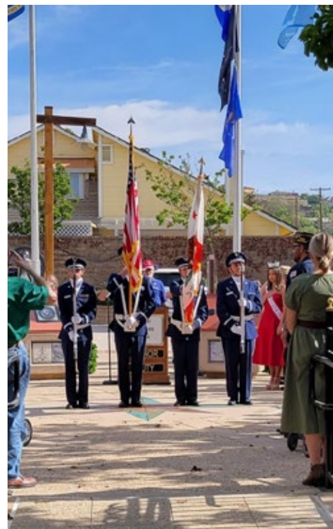
AFJROTC Scripps Ranch colorguard presenting the colors at the ceremony.