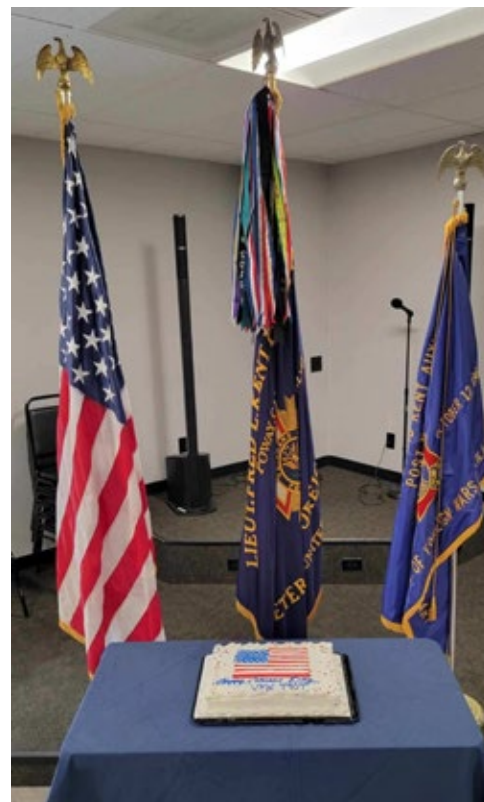
Thank you to Stater Bros. for the wonderful cake.