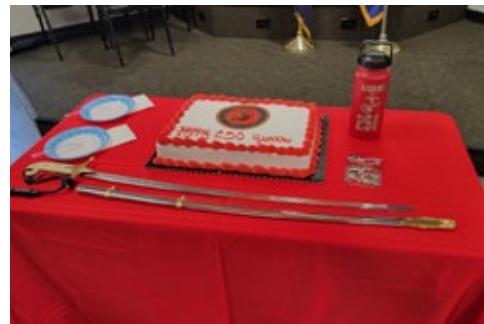
No birthday celebration is complete without cake.