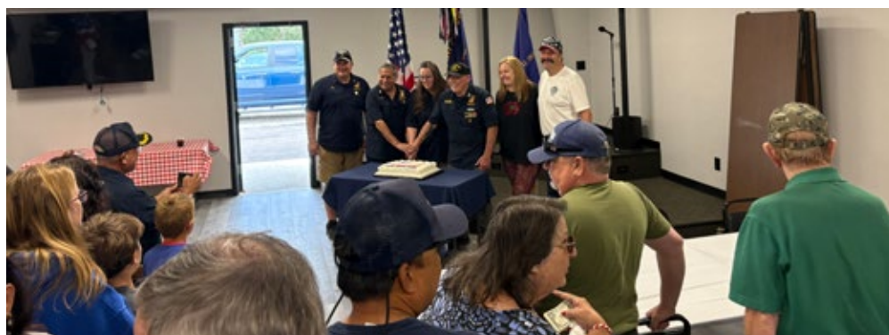
We had a good turn out at the Post.