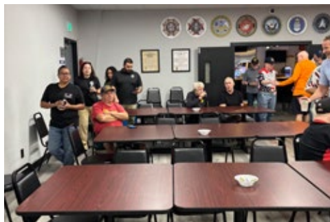
Thanks for your service Marines.