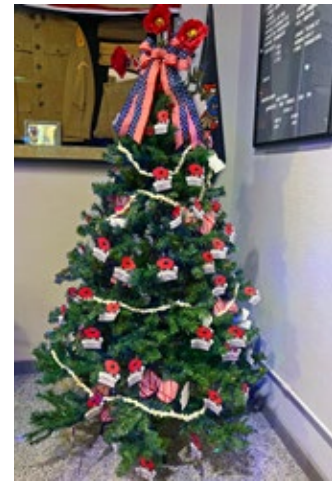
The Giving Tree seeks donation on board VFW 7907, November 20, 2025, Poway, CA.