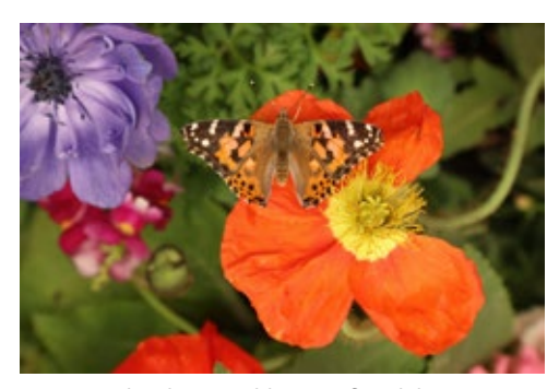
The Flower Fields Butterfly exhibit, 10Mar2025, Carlsbad, CA.