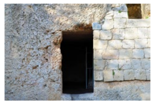
My fellow 24 CUFI-sponsored pastors and I had a surreal and solemn visit at The Garden Tomb, on 21 Feb 2023, near Kidron Valley/Mount of Olive area, Israel.