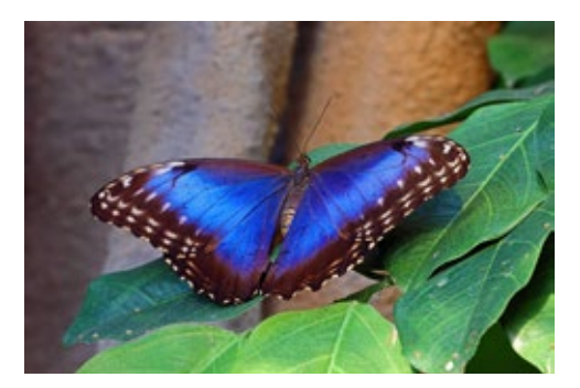
The Blue Morpho Butterfly, 5Jan2024, San Diego Zoo Butterfly exhibit.