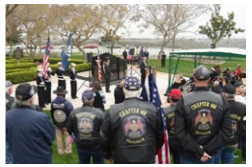
Thank you to all of our Vietnam Veterans.