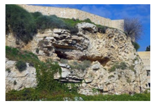
At Golgotha (captured on 23Feb2023), Jesus was died on a cross. He uttered His seven last words. Golgotha translates to "the Place of the Skull." It's a biblical term referring to the site where Jesus was crucified, located just outside the walls of Jerusalem. The name likely comes from the hill's shape, which some say resembled a skull. It's a powerful and deeply significant term in Christian tradition.