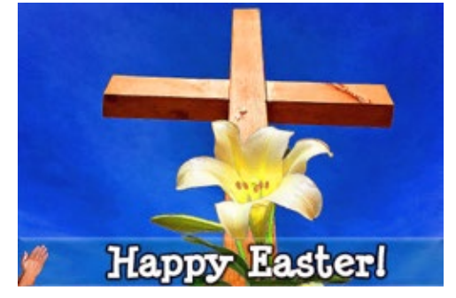
The Easter lily flower was taken on 21Apr2019 at MCAS Miramar Chapel, San Diego. CA.