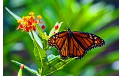
The Monarch Butterfly, 2Jul2024, Carmel Mountain Ranch, San Diego, CA.