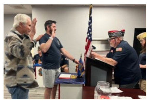
Swearing in two new members.