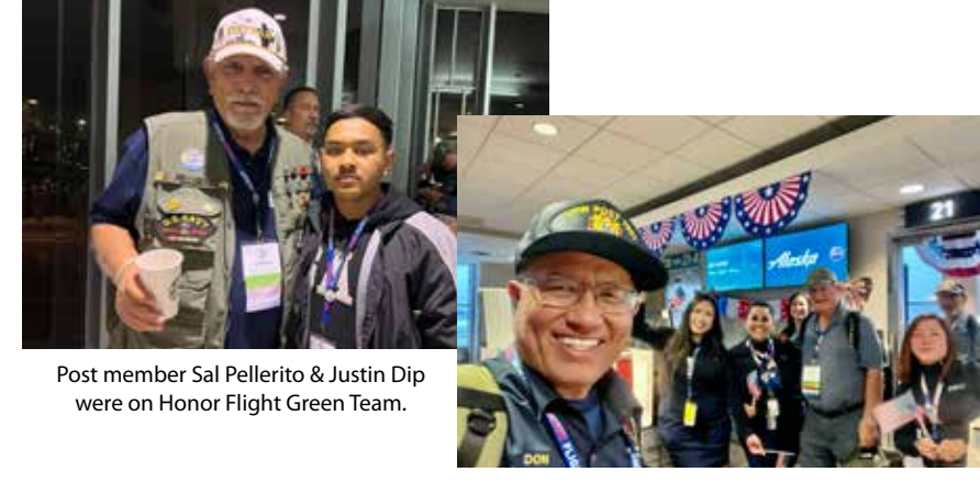
Chaps & the airline crew.