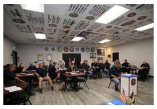
Be sure to join us for our next Post happy hour & general meeting on October 17<sup>th</sup> at 6<sub>PM</sub>.