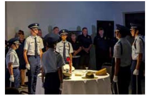
Scripps Ranch HS JROTC doing a salute at the POW/MIA ceremony