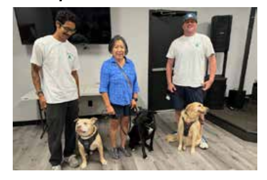
Special thank you to the representatives from Shelter to Soldier for stopping by trivia night!