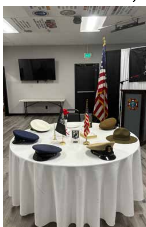
Missing Man Table