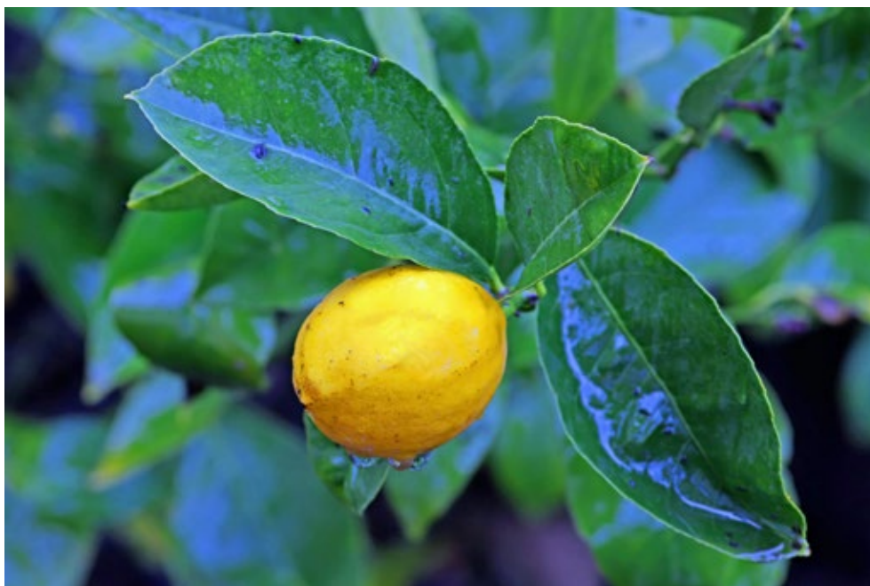
The Lemon tree was actually dying a few years ago but miraculously came back and started bearing fruits. Date captured: February 13, 2025, Carmel Mountain Ranch, San Diego, CA