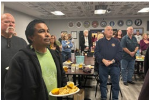
All in attendance stood for the National Anthem during the opening ceremonies.