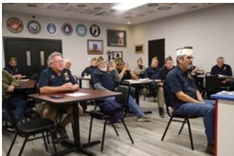
We would love to see you at our next meeting on March 20 th