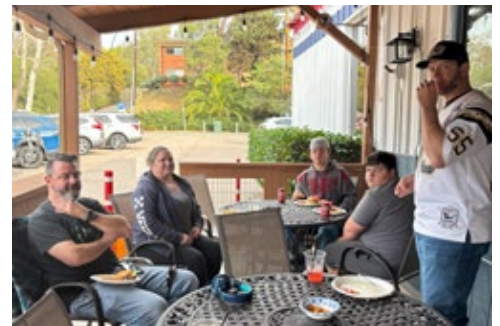
Fun was had by all.