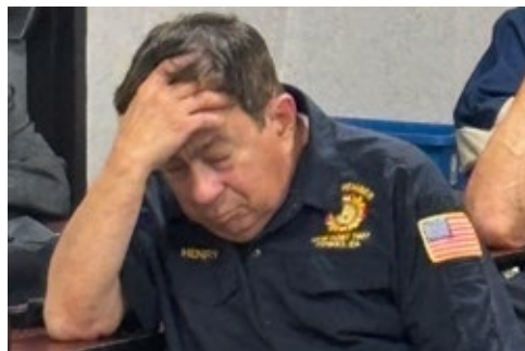
OK, Commander close the meeting already!