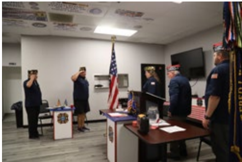
Pledge of Allegiance.