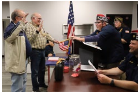
Swearing in two new members.