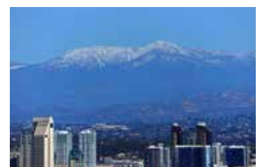
February 11, 2024, from the shore of San Diego / Point Loma area – A snowcapped peak, one of mountains east of San Diego, CA.