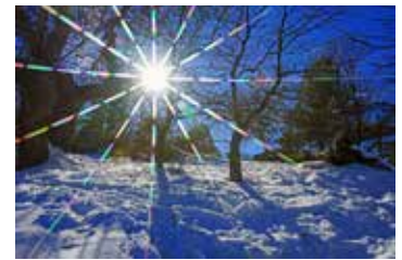
Sun shining through the snow through the snow. 1 Jan 2021, Laguna Mountain, CA.