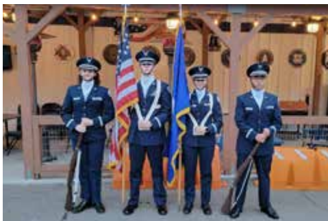
Thanks to the ROTC from Scripps Ranch High School