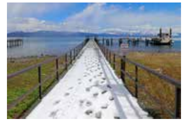
A snow covered walkway leading to a lake. Footprints in the snow captured on 11 May 2022, Lake Tahoe, CA.