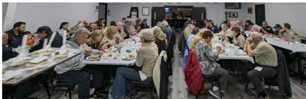
There was a good turnout as we honored our First Responders.