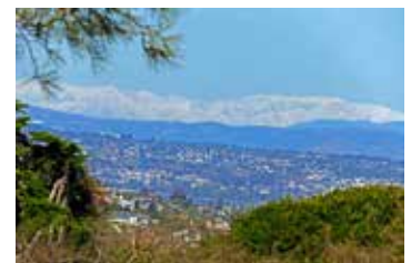
February 11, 2024 a picture-perfect of sand and shore of San Diego / Point Loma area and the snowcapped mountain of San Geronio, nearly 100 miles away.