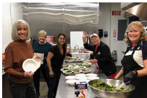
Thank you to Post & Auxiliary members for volunteering in the kitchen!