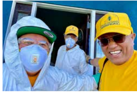
February 15 - Chaps assisted flood victims in the National City & Skyline communities in San Diego.