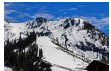
A snowy mountain with trees and a house. Late snowfall 12 May 2022 at the historic Squaw Valley, west of Lake Tahoe, CA.