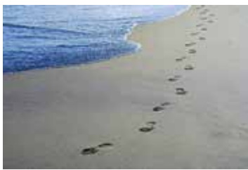
(Top two photos) Footprints in the sand taken on 14 May 2020 on board Naval Air Station North Island, Coronado, CA. It's the location where "Top Gun: Maverick" was filmed.