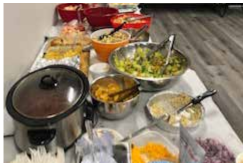
There was no shortage of amazing food!