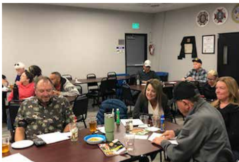
Attendees concentrating on their commercial bingo cards! All proceeds from the games went to the families of the fallen Marines that perished on Feb 6 th .