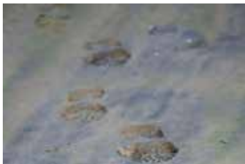
A close-up of a foot print I walked on sandy area under the Nimitz Bridge, Liberty Station, on February 28, 2024, during low tide.

Following our Sunday Service on February 11, 2024, I saw something very nice and rare view. It was a picture-perfect of sand and shore of San Diego / Point Loma area and the snowcapped mountain of San Geronio, nearly 100 miles away.