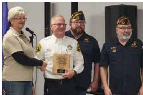
Congratulations to all the award recipients.