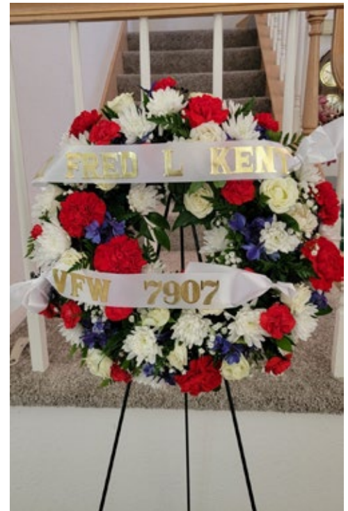
Beautiful wreath for LT Fred L. Kent gravesite.