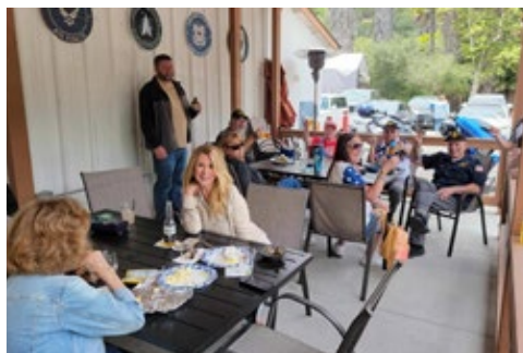
There was a large turnout at the Post after the ceremony at Dearborn Memorial Park.