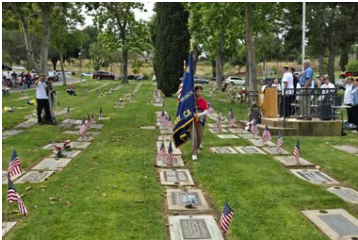
The Heritage Girls presented the colors.