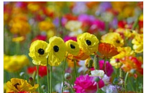
You can enjoy the flowers all year round or for two months once a year, such as a visit on May 18, 2024, The Flower Fields, Carlsbad, CA, will brighten your day.