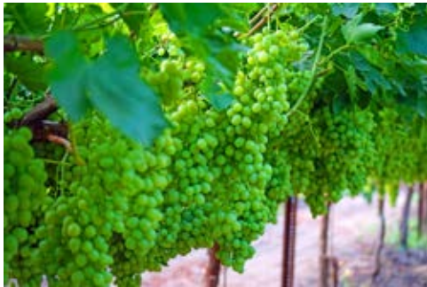
Grapevines on July 22, 2021, Visalia, CA.