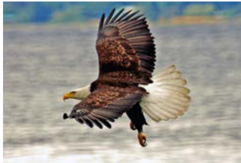
Bald eagle hunting for fish on May 25, 2013, Seabeck, WA.