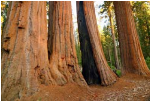
Sequoia Trees on July 20, 2021, Kings Canyon National Park.