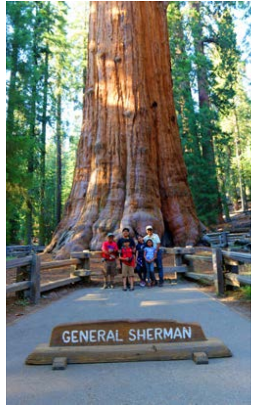
General Sherman Sequoia Tree on July 20, 2021, Sequoia National Park.