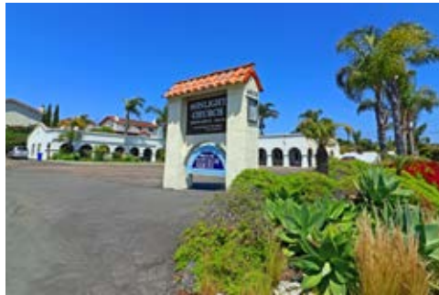
SonLight Church on May 9, 2024, San Diego, CA.