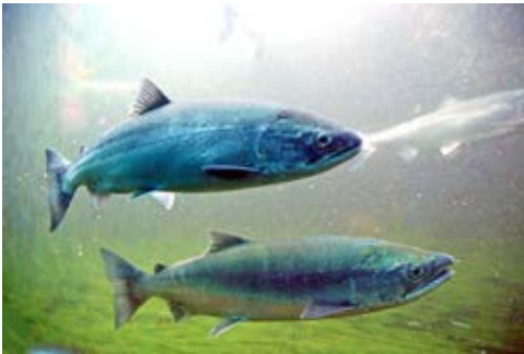
Sockeye salmon swimming up stream on July 27, 2017, Ballard Locks, Seattle, WA.

(1) Enjoy the beauty of God's creation! Amid our difficulties let's take time, to walk, run, bike or hike, smell the flowers , and enjoy the beauty of God's creations (for instance, Sequoia and Kings Canyon National Parks ) and the company of loved ones in San Diego (or wherever your loved ones live on this planet earth).