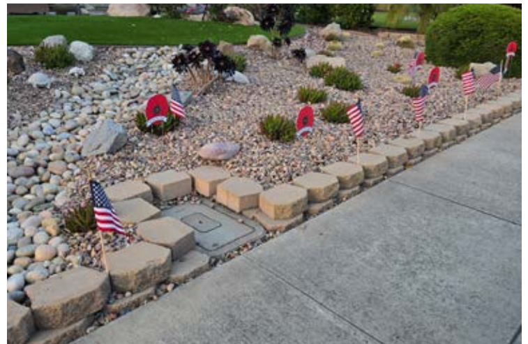
Everyone loved they're yards displaying flags and poppy's for Memorial Day.