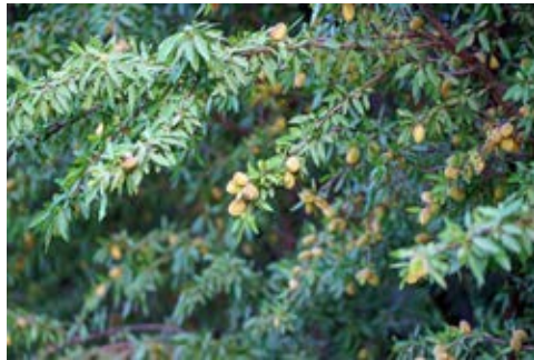
Walnuts plantation on July 22, 2021, Visalia, CA.