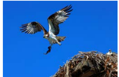
Osprey caught her fish on May 9, 2024, in Diego Bay, Shelter Island, San Diego, CA.