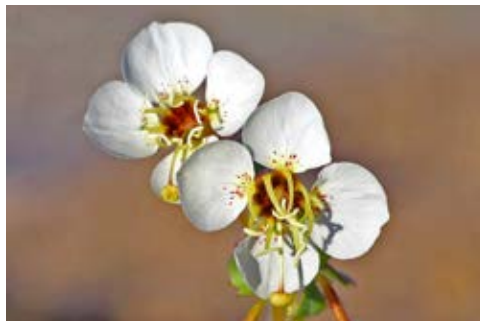
Early part of the year on Feb 3, 2023, at Borrego Spring State Park, you may enjoy the desert floras in Borrego Spring, CA.