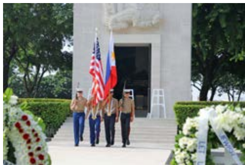
US and Philippine Marines carrying the flags during the annual Memorial Day service, May 28, 2023, honoring the war dead heroes buried at Manila American Cemetery, Taguig, Philippines