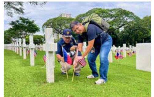
May 24, 2024 - Mission accomplished - Placing of 34,000 Flags on the hallowed grounds of Manila American Cemetery.