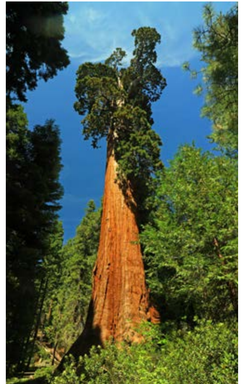
General Grant Sequoia Tree on July 22, 2021, Kings Canyon National Park.