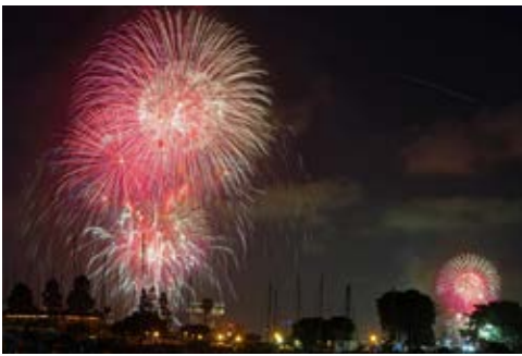
Thousands of visitors & locals enjoy the Big Bay Boom each July the 4 th , the fireworks are visible throughout the San Diego Bay including from the Naval Submarine Base, Point Loma, CA last July 4, 2022.

Secondly, about 6,400 Japanese, Koreans, and Americans died in the Battle of Tarawa fought on 20-23 November 1943. It was a battle between the United States forces and Japan Imperial forces at the Tarawa Atoll in the Gilbert Islands. It was called "Operation Galvanic," the U.S. invasion of the Gilberts.