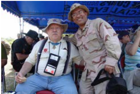
Jack Lucas, MOH recipient, an honor to meet him in Iwo Jima on March 12, 2005, the 60 th Anniversary of the Battle of Iwo Jima.