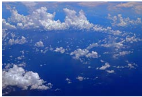
On my way home from a special mission in the Philippines, from 34,000 feet above I looked down from the portside window of United Airlines (MNL TO SFO) on June 7, 2024, I was reminiscing & remembering the sacrifices of our World War II veterans.