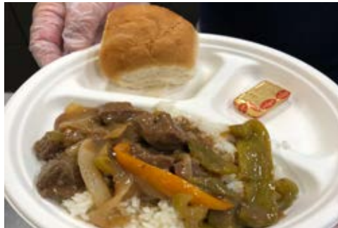
We serve up fabulous lunches each Wednesday like this one.