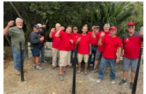
Cheers to the Clampers!

We have a good time here at the Post. Be sure to stop by enjoy a meal, some comradery and join us as we serve veterans and their families.