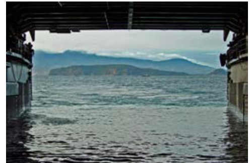
View from the well deck of USS Ft McHenry (LSD-43) in March 2004.