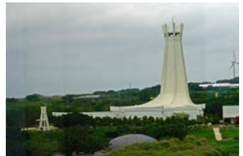
South of Hacksaw Ridge is the Prefectural Peace Memorial Museum. Photo was taken on May 7, 2005. Itoyan, Okinawa.