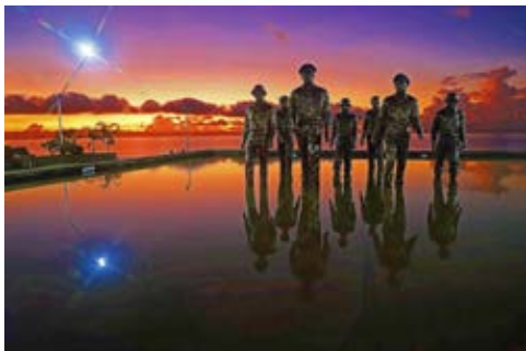
At dawn view of the shrine of the Leyte Landings on the 75 th Anniversary, October 20, 2029, Palo Leyte, Philippines.