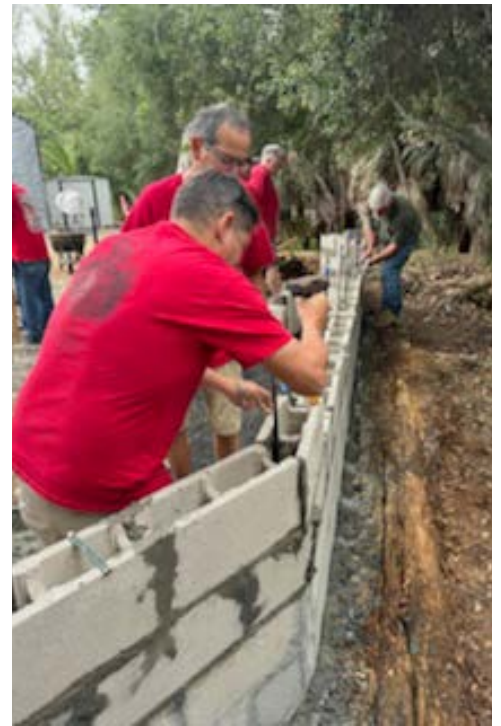
Special thanks to the Clampers for building the wall behind our flag retirement pit.