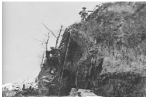
In May 1945, a man named Desmond Doss, who was a conscientious objector, saved 75 wounded soldiers during the Battle of Okinawa at Hacksaw Ridge.