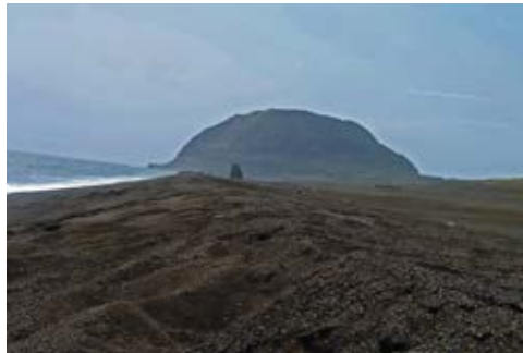
I had an honor to visit Iwo Jima on March 12, 2005 during the 60 th Anniversary of the Battle of Iwo Jima.