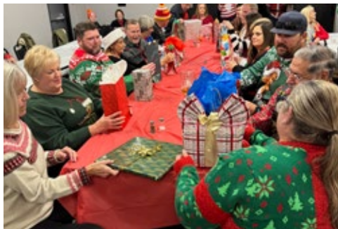
The white elephant gift exchange.