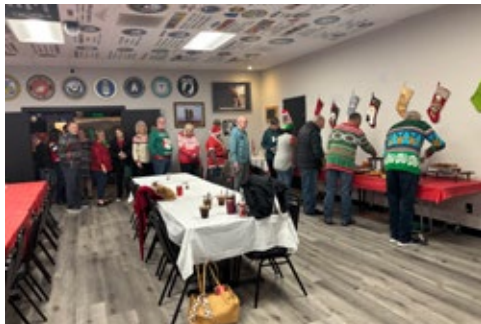
We had a nice spread. Thanks to all who brought a dish.