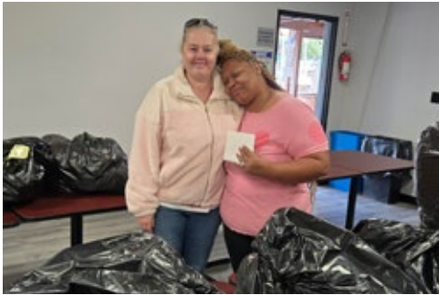
The Auxiliary delivered gifts to 10 active duty families with 30 kids. Each family received over $400 in gift cards as well!