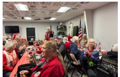
Thank you to all our Vietnam Veterans. It was a pleasure to host a Christmas party for you.