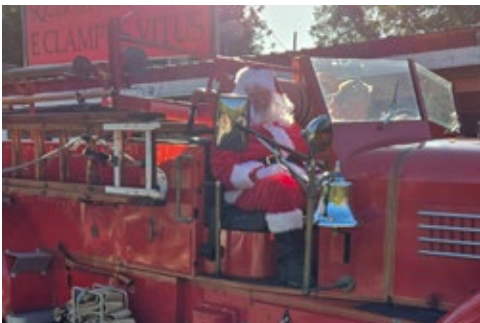
Santa arrived in style and ready to bring some Christmas cheer.