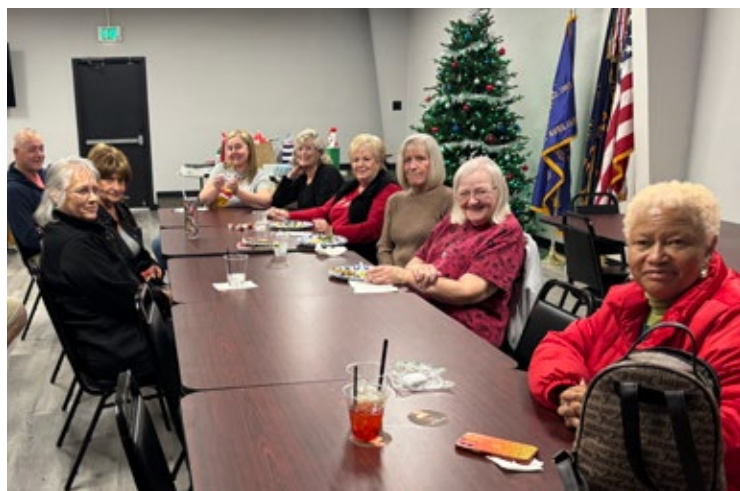
Auxiliary pre-meeting fun.