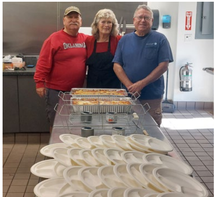
Wednesday Lunch Crew preparing for the last lunch of 2024.

Apr 20 – Easter Brunch *This year we will have an Easter egg hunt as well*