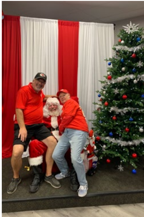
Santa spent the morning taking gift requests at our District Auxiliary fundraiser on 12/15.