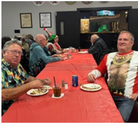
We had a good turn out for the Christmas party. Thank you to everyone who has made the Post as success.