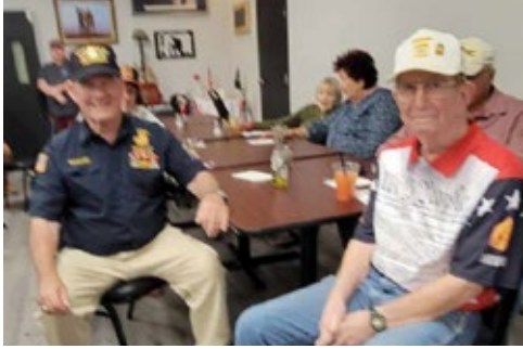
Thanks for your service Marines.