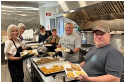
Thanks to the Kitchen Crew for Marine birthday.