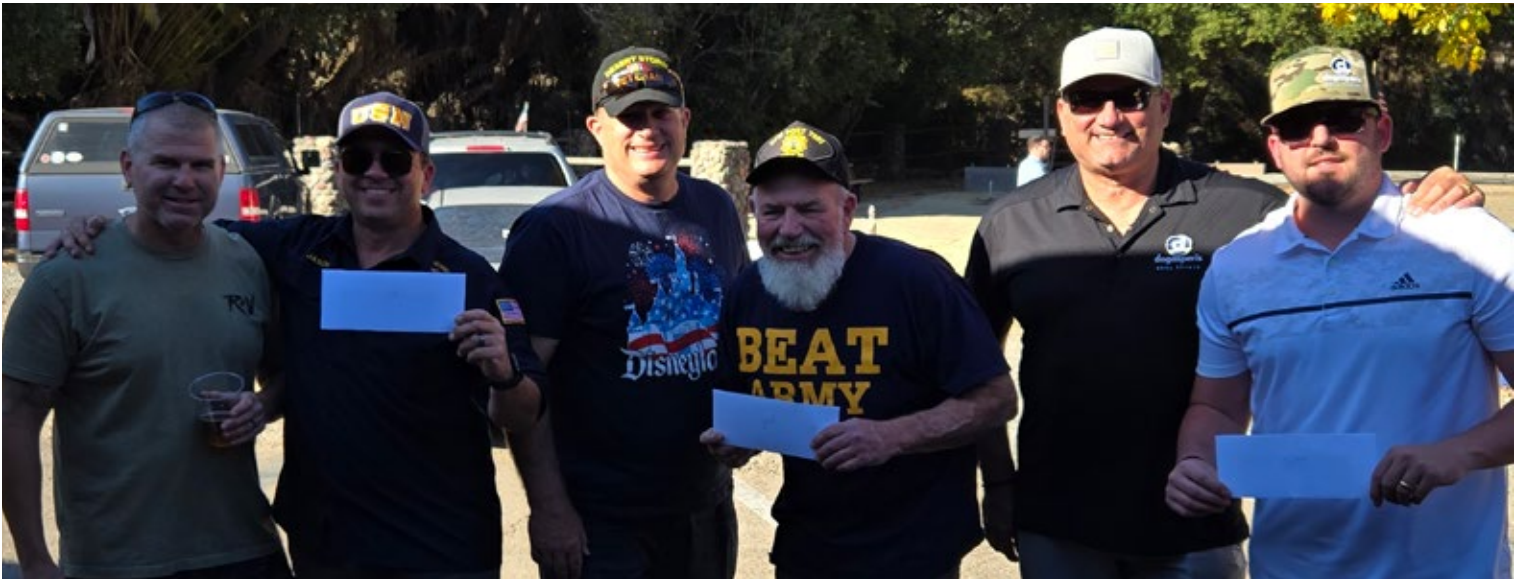
Congratulations to the winners of the Veterans Day Cornhole tournament