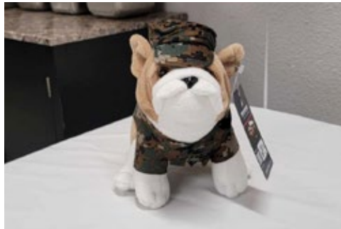
No celebration would be complete without the Marine Corps mascot.