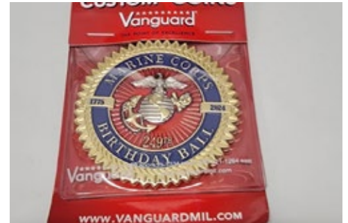
249 th Marine Corps Birthday coin.