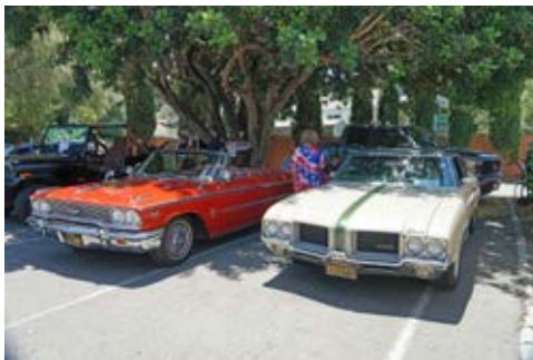
There were a lot of "sweet rides" at this years car show.