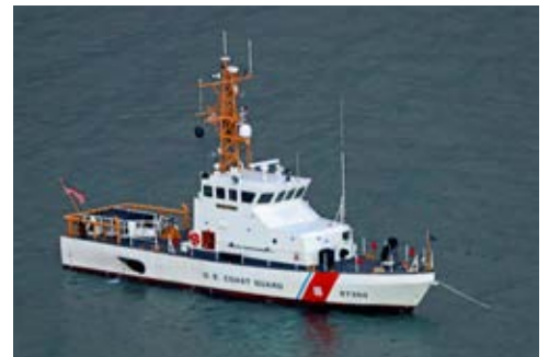
USCG Cutter Petrel (WPB 87350) patrols the San Diego Bay on January 24, 2021, San Diego, CA