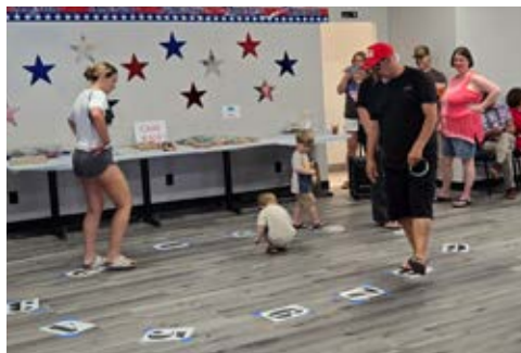
Adults & kids had a blast doing the cake walk!