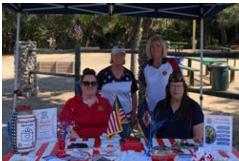
Post & Auxiliary members staff the VFW booth encouraging people visiting to support the Post.