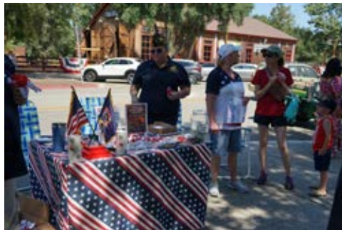
Post Buddy Poppy booth at the Poway Veterans Park.