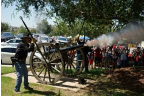
Always a crowd pleaser, the firing of the cannon.