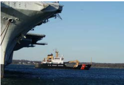
The USCGC Willow (WLB-202), a USCG seagoing buoy tender, performing her duty on November 19, 2008, around Narragansett Bay, Newport, RI.