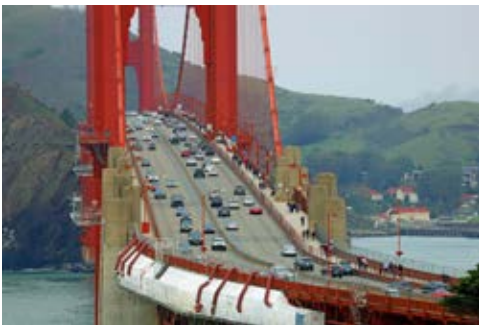
The U.S. Coast Guard Station Golden Gate is one of the busiest Coast Guard stations in the United States. I took the photo of the Station Golden Gate (right of the photo) on December 28, 2021, from the south side of the Golden Gate Bridge.