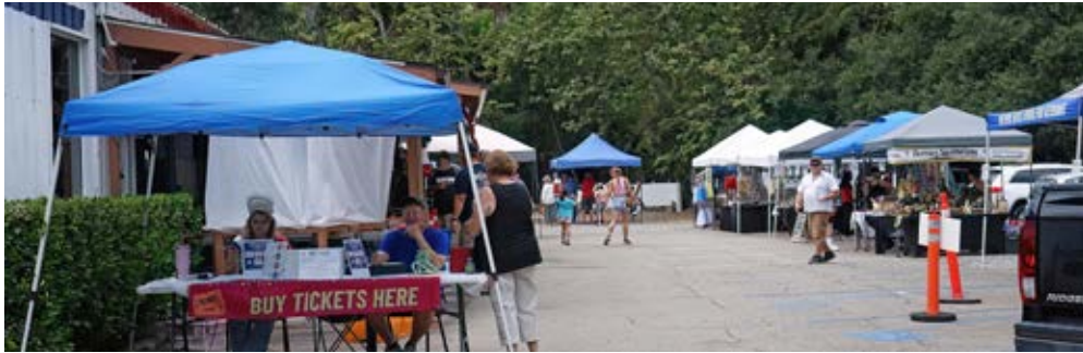
We had a very successful event this year.