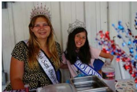
Our local pageant princesses helped out with a smile.