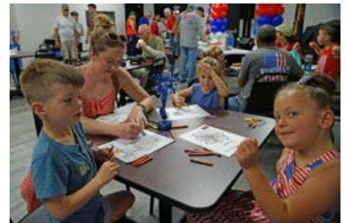
The hall was full of happy children and adults alike.