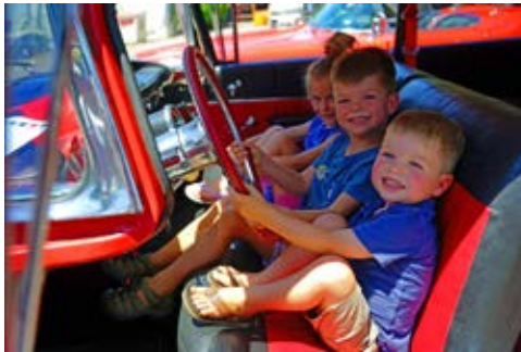
The kiddos really enjoyed the classic car show.