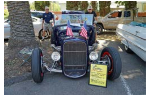
La Betty '29 Ford Coupester