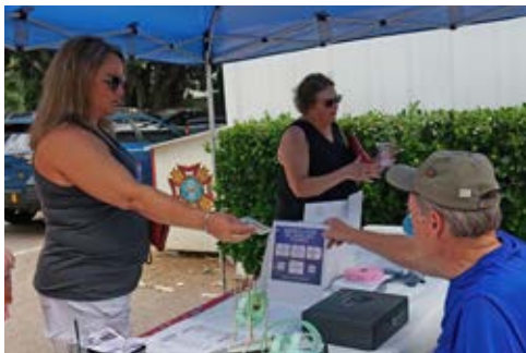
A visitor purchases tickets for the event.