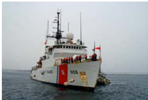
USCGC Tahoma (WMEC-908) visits on January 15, 2009, Narragansett Bay, Naval Station Newport, RI.