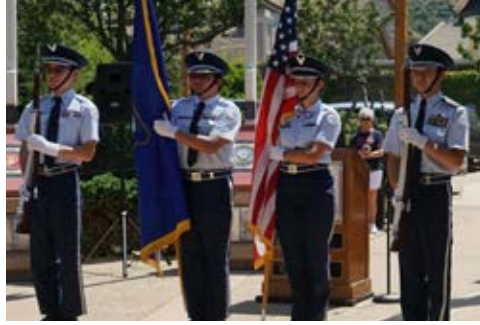
Scripps Ranch HS ROTC presented the colors during the ceremony.