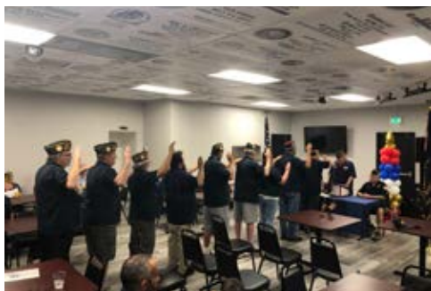
'24-'25 Post officers being sworn in.