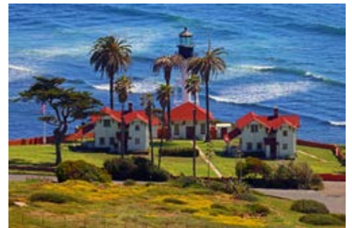
One of the most beautiful U.S. Coast Guard Lighthouses is located on board Cabrillo National Monument (CNM), Point Loma, CA. I took the photograph on April 28, 2024, CNM.