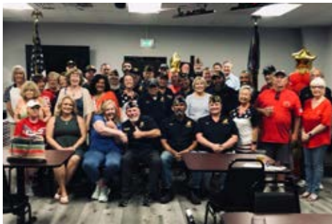
Post & Auxiliary officers and members ready for a successful '24-'25 year.