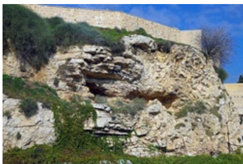
At Golgotha (captured on 23Feb2023), Jesus was died on a cross. He uttered His seven last words. Golgotha translates to "the Place of the Skull." It's a biblical term referring to the site where Jesus was crucified, located just outside the walls of Jerusalem. The name likely comes from the hill's shape, which some say resembled a skull. It's a powerful and deeply significant term in Christian tradition.