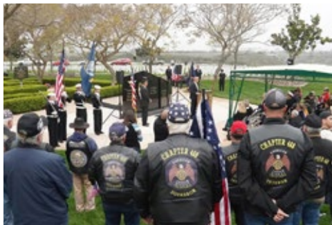
Thank you to all of our Vietnam Veterans.