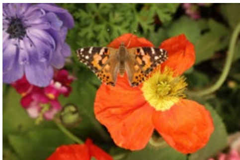
The Flower Fields Butterfly exhibit, 10Mar2025, Carlsbad, CA.