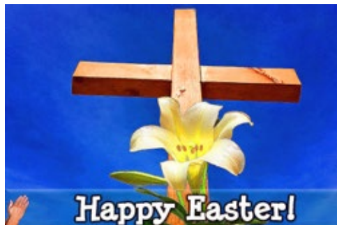
The Easter lily flower was taken on 21Apr2019 at MCAS Miramar Chapel, San Diego, CA.