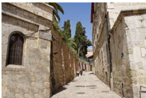
The street in Old City of Jerusalem, Israel, named Via Dolorosa (meaning the "Way of Suffering") was taken on 28May2011, Jerusalem, Israel.