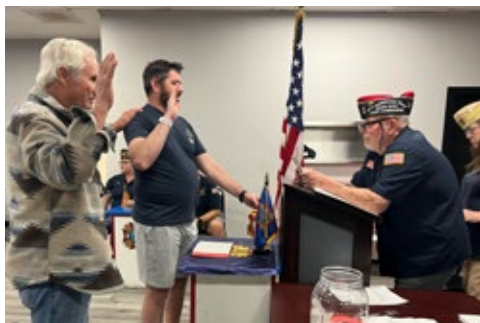
Swearing in two new members.